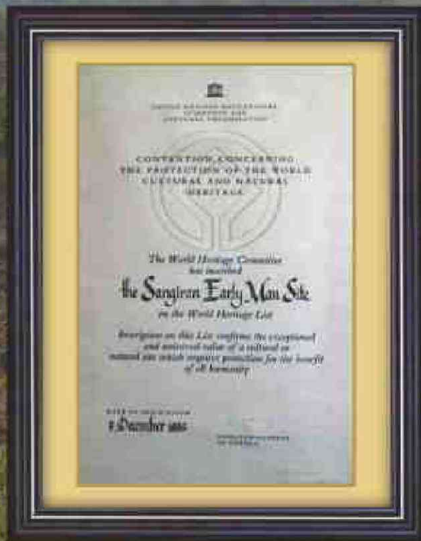
Sangiran Site was established as World Cultural Heritage by UNESCO in 1996, listed in Number C. 593 with the name The Sangiran Early Man Site.