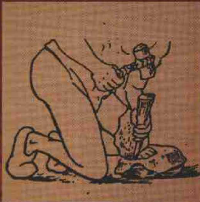
indirect chipping technique

The more advance technique is the indirect chipping done by using a kind of chiseling tool hit by the percutor like wood, bone, and antler on the material. It is easier to control the shaping of perfect tool.