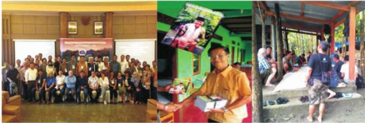
Fig 3. Local involvement in Scientific Activities; (left) meeting and discussion by PREHsea, (middle) local publication published by local, (right) discussion led by local's about sangiran's deposits.

sites grounded on the activities in Sangiran area, in collaboration with regional and international communities and with UNESCO (Fig 3).