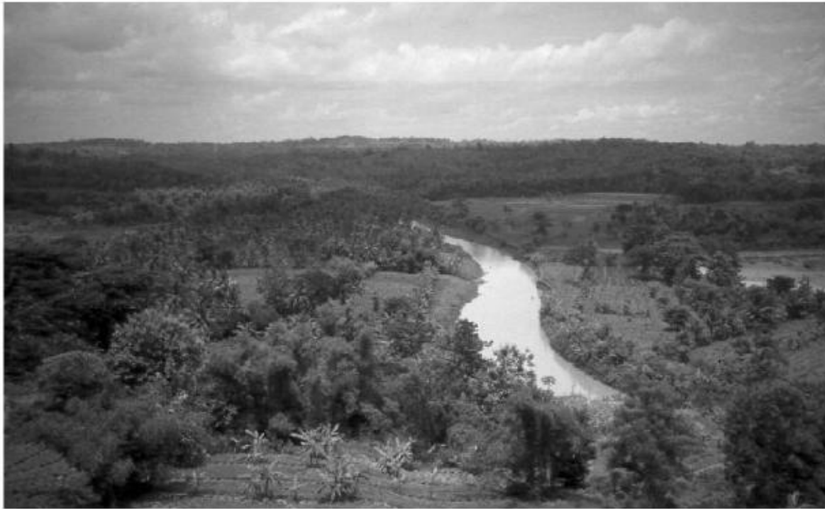
Fig.1. The Sangiran Dome

Since 1996, Sangiran has become a UNESCO's world heritage property whose Outstanding Universal Value (OUV) is grounded on the fact that it represents a unique natural laboratory in Island Southeast Asia documenting the antiquity of the dynamics of paleoenvironment, human migrations and adaptation, cultural and technological development of prehistoric human groups spanning more than 1 million years ago.